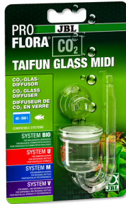
JBL PROFLORA CO2 TAIFUN GLASS Glass CO2 diffuser for freshwater tanks from 40-300 l