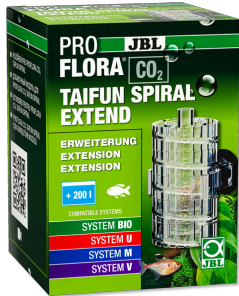
JBL PROFLORA CO2 TAIFUN SPIRAL EXTEND Extension for JBL PROFLORA CO2 TAIFUN SPIRAL 5 / 10