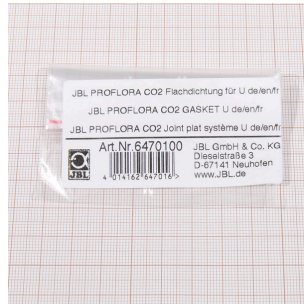
JBL PF CO2 flat gasket for u