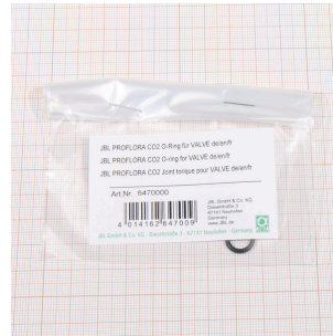
JBL PF CO2 O-ring for VALVE