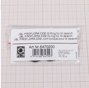
JBL PROFLORA CO2 O- ring for m