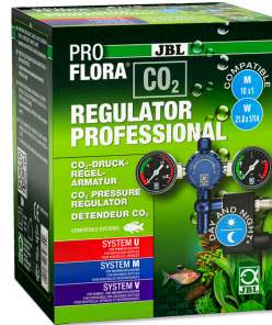
JBL PROFLORA CO2 REGULATOR PROFESSIONAL Pressure regulator with 2 displays & valve for CO2