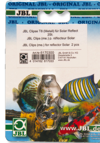
JBL Clips T5/T8 (Metal) Metal holder für fluorescent tubes