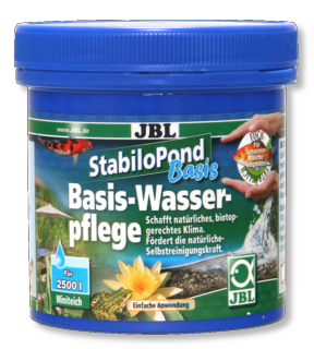
JBL StabiloPond Basis Basic care product for all garden ponds