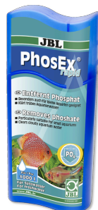
JBL PhosEx rapid Phosphate remover for freshwater aquariums