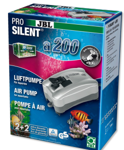
JBL PROSILENT a200 Air pump for fresh and saltwater aquariums