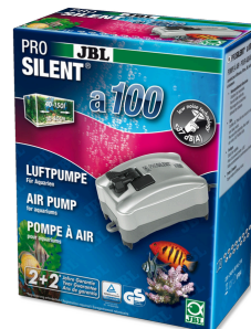
JBL PROSILENT a100 Air pump for fresh and saltwater aquariums