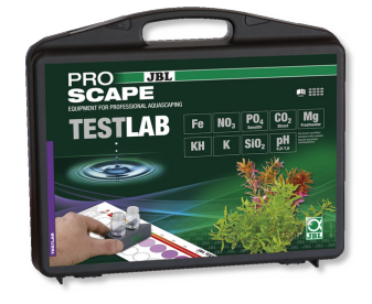
JBL Testlab ProScape Test case for water analysis in plant aquariums