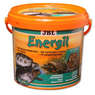
JBL Energil Main food for turtles and pond terrapins