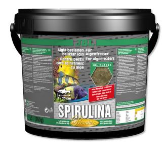
JBL Spirulina Premium main food for algaeeating aquarium fish