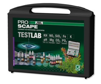
JBL PROAQUATEST LAB PROSCAPE

Test case for water analysis in plant aquariums