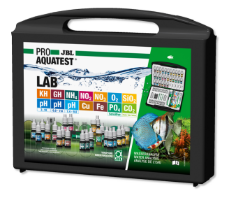
JBL PROAQUATEST LAB Test case with 13 water tests

Test case with most important water tests + iron test