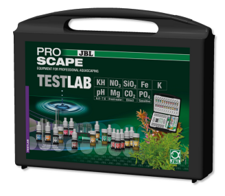
JBL PROAQUATEST LAB PROSCAPE

Test case for water analysis in plant aquariums