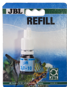
JBL pH Test 3.0-10.0 Quick test to determine the acidity