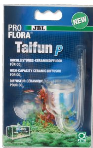
JBL PROFLORA Taifun P Mini CO2 diffuser for nano freshwater aquariums