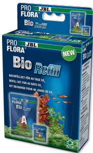
JBL PROFLORA BioRefill Refill set for bio-CO2 systems