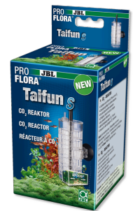
JBL PROFLORA Taifun S Extendable CO2 diffuser for small aquariums