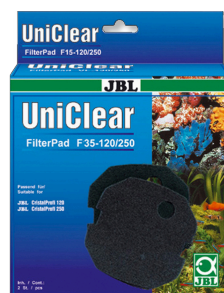
JBL FilterPad F35 Fine foam pad for aquarium filter CristalProfi