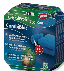
JBL CombiBloc CristalProfi e Pre-filter pads and filter foam for CristalProfi e