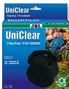
JBL FilterPad F15 Coarse foam pad for aquarium filter CristalProfi