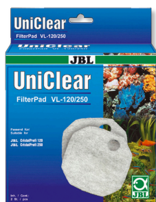
JBL FilterPad VL Cotton fleece for CristalProfi aquarium filters