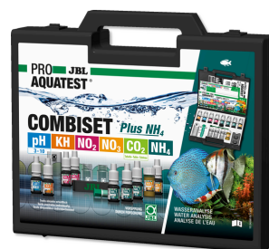
JBL PROAQUATEST COMBISET Plus NH4 Test case with most important water tests + NH4 test