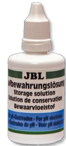
JBL Storage Solution Cleaning and storage solution for pH electrodes