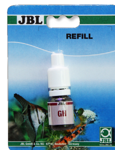
JBL GH Test Quick test to determine the total hardness