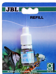
JBL pH Test 7.4-9.0 pH test in aquariums and ponds in the range 7.4-9.0