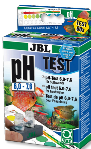
JBL pH Test 6.0-7.6 pH test for freshwater aquariums in the range 6.0-7.6