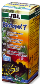
JBL Biotopol 7 Water conditioner for terrariums