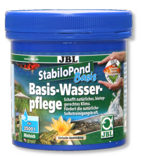
JBL StabiloPond Basis Basic care product for all garden ponds