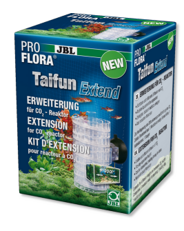
JBL PROFLORA Taifun Extend Extension for CO2 highperformance diffuser