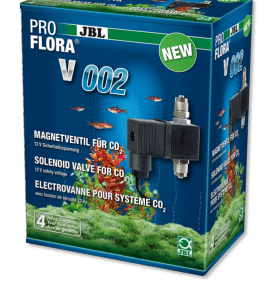
JBL PROFLORA v002 Noiseless solenoid valve