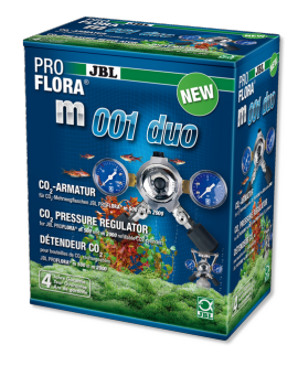
JBL PROFLORA m001 duo Fitting to reduce pressure for 2 CO2 diffusers