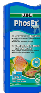
JBL PhosEx rapid Phosphate remover for freshwater aquariums