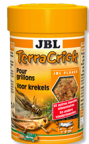
JBL TerraCrick Complete food for feeder insects