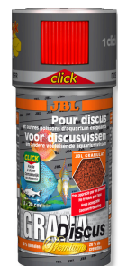
JBL GranaDiscus CLICK Premium main food granulate with doser for discus fish