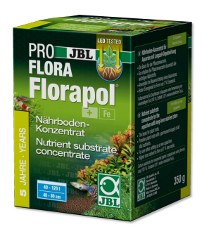
JBL PROFLORA Florapol Long-term nutrient substrate concentrate

Root fertiliser for freshwater aquariums