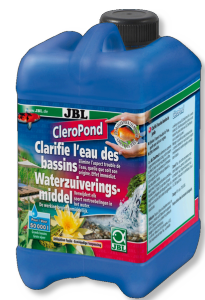
JBL CleroPond Water clarifier for the elimination of water cloudiness