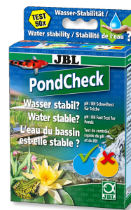
JBL PondCheck Quick test to determine the pH and KH values