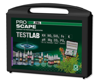
JBL PROAQUATEST LAB PROSCAPE

Test case for water analysis in plant aquariums