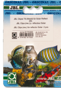
JBL Clips T5/T8 (Metal) Metal holder für fluorescent tubes