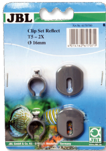
JBL SOLAR REFLECT Clip Set Holder for fluorescent tubes