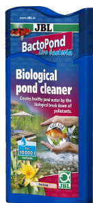
JBL BactoPond Bacteria for biological purification of the pond