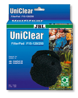
JBL FilterPad F15 Coarse foam pad for aquarium filter CristalProfi