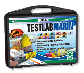
JBL Testlab Marin Professional test case for the analysis of saltwater