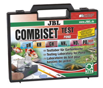
JBL Test Combi Set Pond

The most important water tests for garden ponds