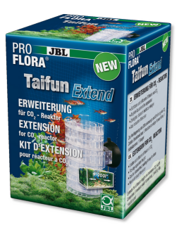
JBL PROFLORA Taifun Extend Extension for CO2 highperformance diffuser