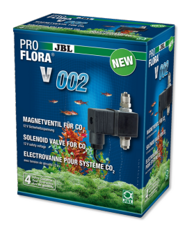
JBL PROFLORA v002 Noiseless solenoid valve