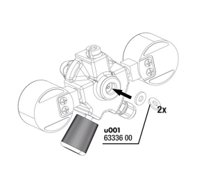
JBL ProFlora "u" flat seal