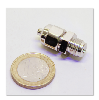
JBL tube screw connection 4/6 pressure reducer