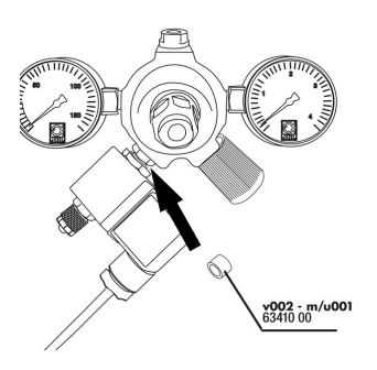
JBL ProFlora "u/m" flat seal