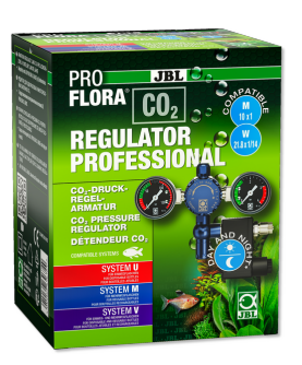
JBL PROFLORA CO2 REGULATOR PROFESSIONAL

Glass CO2 diffuser for freshwater tanks from 40-300 l