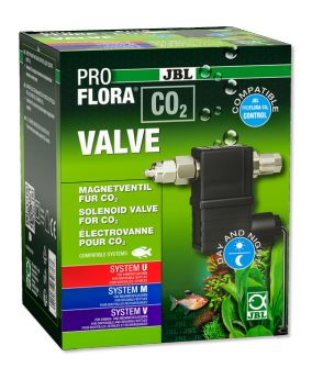
JBL PROFLORA CO2 VALVE

Refillable storage cylinder, ready-filled with 2kg CO2