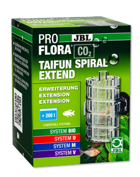
JBL PROFLORA CO2 TAIFUN SPIRAL EXTEND

CO2 bubble counter with builtin check valve