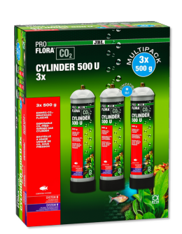
JBL PROFLORA CO2 CYLINDER 500 U 3x

Expandable CO2 reactor for freshwater aquariums