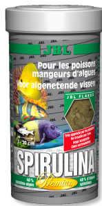
JBL Spirulina Premium main food for algae-eating aquarium fish