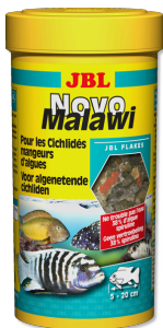
JBL NovoMalawi Main food flakes for algae-eating cichlids