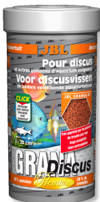
JBL GranaDiscus Premium main food granulate for discus fish