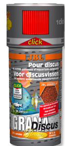
JBL GranaDiscus CLICK Premium main food granulate with doser for discus fish