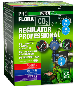
JBL PROFLORA CO2 REGULATOR PROFESSIONAL Pressure regulator with 2 displays & valve for CO2