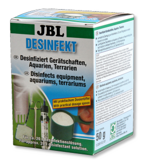
JBL Desinfekt Disinfettante per acquari