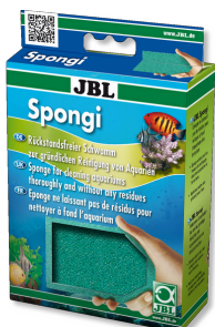
JBL Spongi Cleaning sponge for aquariums and terrariums