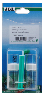
JBL component set for water tests