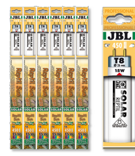
JBL SOLAR REPTIL SUN T8 Special T8 terrarium fluoresc. tube for desert animals