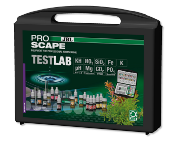
JBL PROAQUATEST LAB PROSCAPE Test case for water analysis in plant aquariums