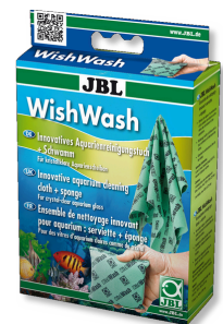
JBL WishWash Cleaning cloth and sponge