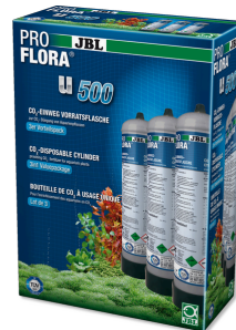
JBL PROFLORA 3 x u500 CO2 disposable storage cylinder