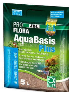
JBL PROFLORA AquaBasis plus

Plant fertiliser for freshwater aquariums