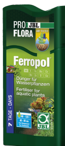
JBL PROFLORA Ferropol

Plant fertiliser for freshwater aquariums