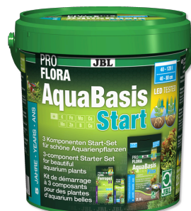
JBL PROFLORA AquaBasis Start

Long-lasting nutrient substrate f. freshwater aquarium