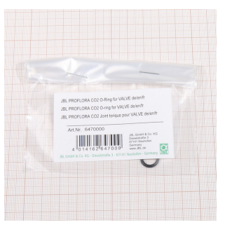
JBL PF CO2 O-ring for VALVE