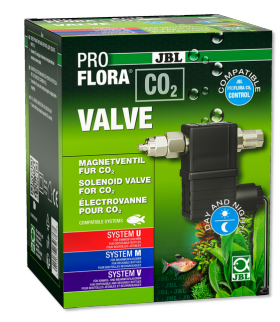
JBL PROFLORA CO2 VALVE CO2 solenoid valve for regulated CO2 addition