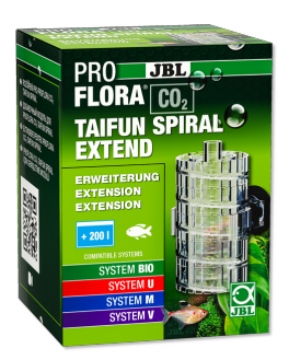
JBL PROFLORA CO2 TAIFUN SPIRAL EXTEND Extension for JBL PROFLORA CO2 TAIFUN SPIRAL 5 / 10