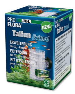
JBL PROFLORA Taifun Extend Extension for CO2 highperformance diffuser