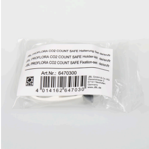
JBL PF CO2 COUNT SAFE holder set