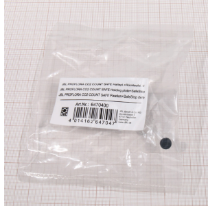
JBL PF CO2 COUNT SAFE mounting plate + backstop