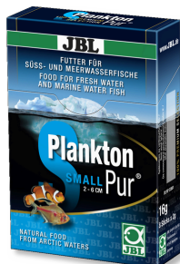
JBL PlanktonPur SMALL