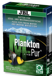
JBL PlanktonPur MEDIUM