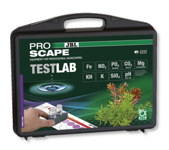
JBL Testlab ProScape Test case for water analysis in plant aquariums