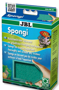
JBL Spongi Cleaning sponge for aquariums and terrariums