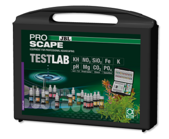
JBL PROAQUATEST LAB PROSCAPE Test case for water analysis in plant aquariums