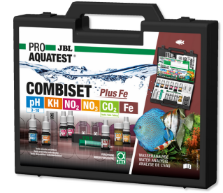
JBL PROAQUATEST COMBISET Plus Fe Test case with most important water tests + iron test