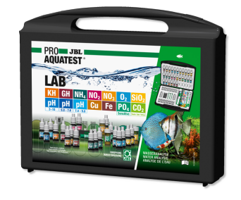
JBL PROAQUATEST LAB Test case with 13 water tests for freshwater analysis