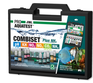
JBL PROAQUATEST COMBISET Plus NH4 Test case with most important water tests + NH4 test